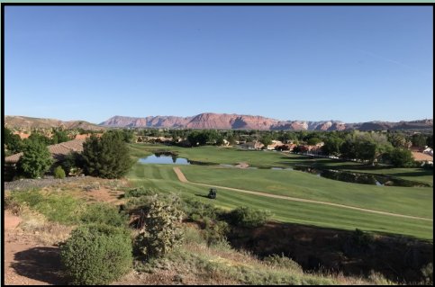
Adjacent to Sunbrook Golf Course